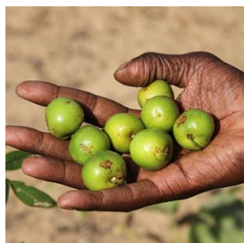
SOS Sahel Senegal

To access the funding platform and find out more about each planting project, click on the links below: