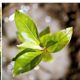
Pur Hexagone France

Since 2009, AccorHotels has been supporting local communities and small-scale farmers through Plant For the Planet . With the help of its partner Pur Projet , the Group is committed to planting trees on the edge of or in the heart of cultivated or grazing land, in a drive to preserve and regenerate ecosystems. The aim is to promote the transition towards more eco-friendly farming and offset the impact on water quality and biodiversity resulting from the agricultural production stage of the food consumed in the hotels.