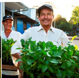
Alto Huayabamba Peru