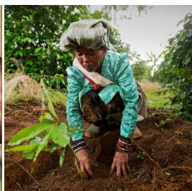
Kopi Lestari Indonesia