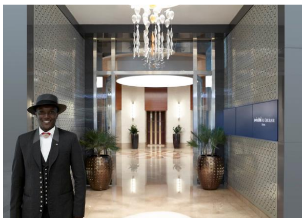
Entrance, Swissôtel Al Ghurair

Al Ghurair Properties launch flagship Swissôtel in Dubai with opening of Swissôtel Al Ghurair