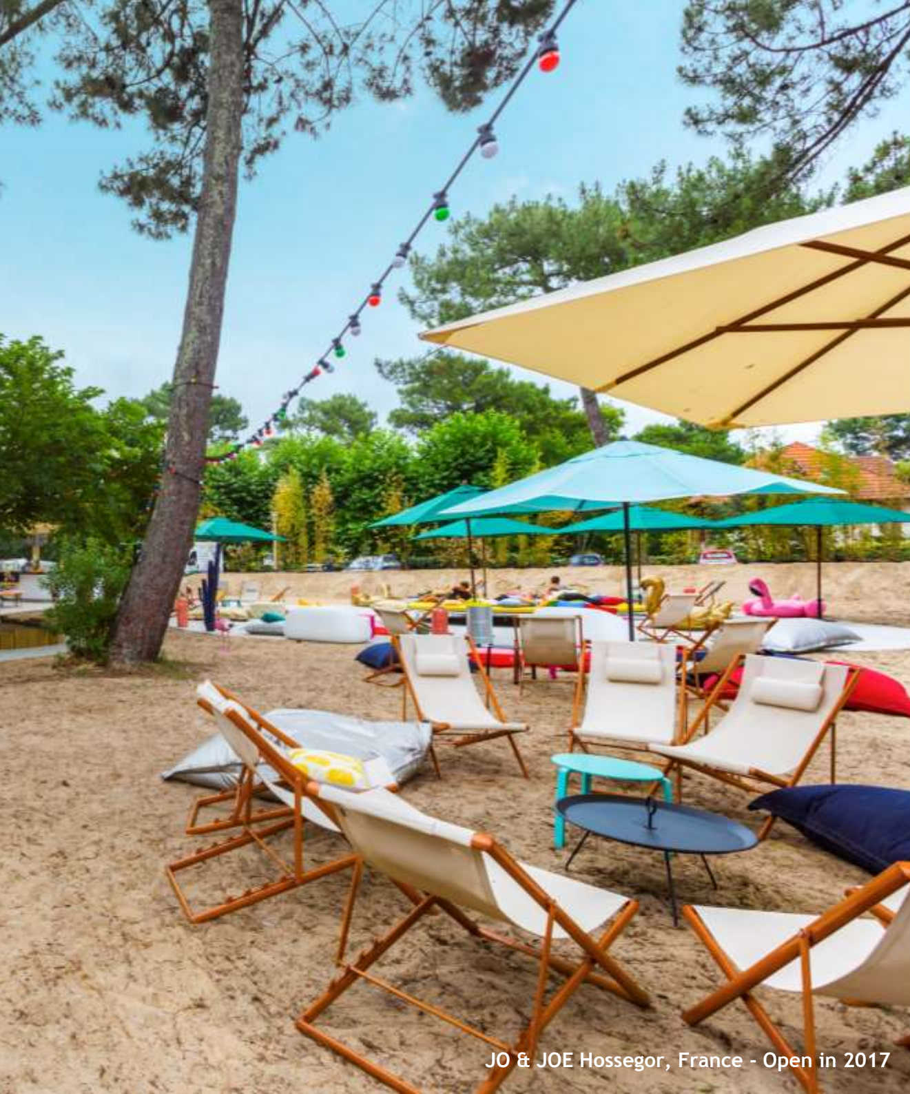
JO & JOE Hossegor, France - Open in 2017