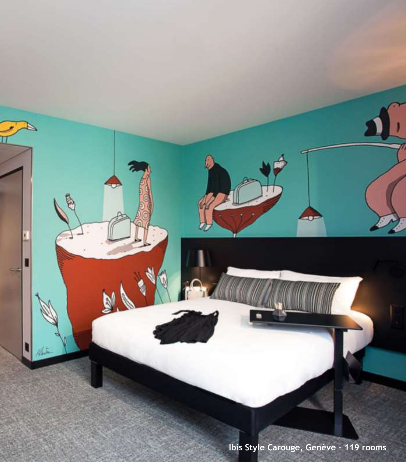
Ibis Style Carouge, Genève - 119 rooms