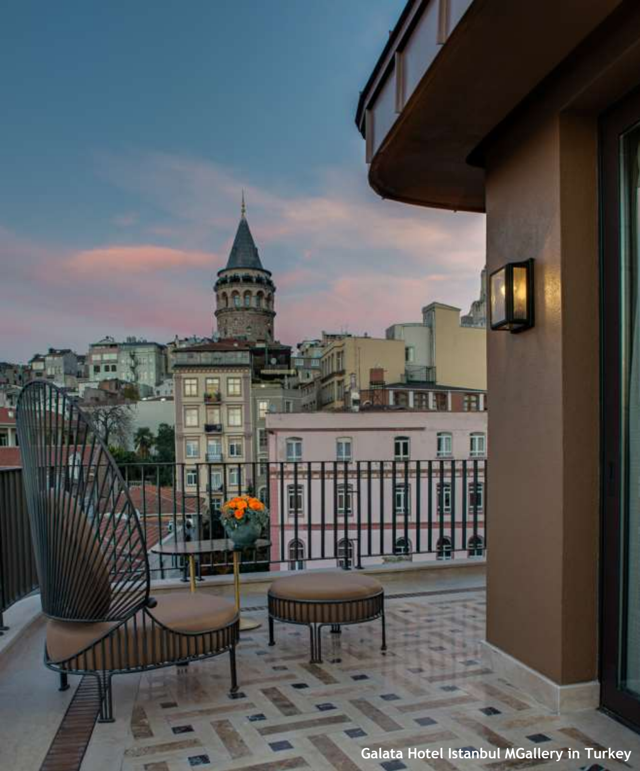
Galata Hotel Istanbul MGallery in Turkey