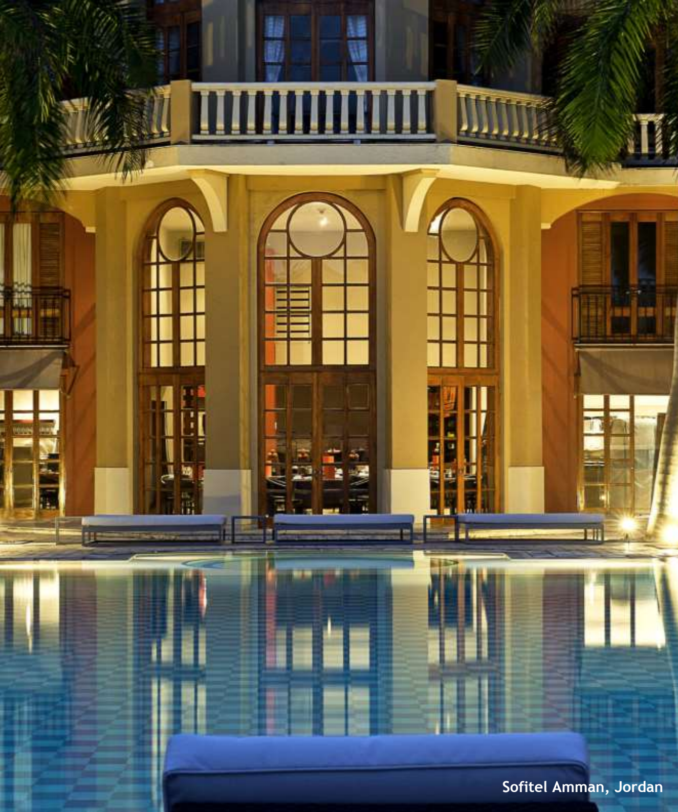
Sofitel Amman, Jordan