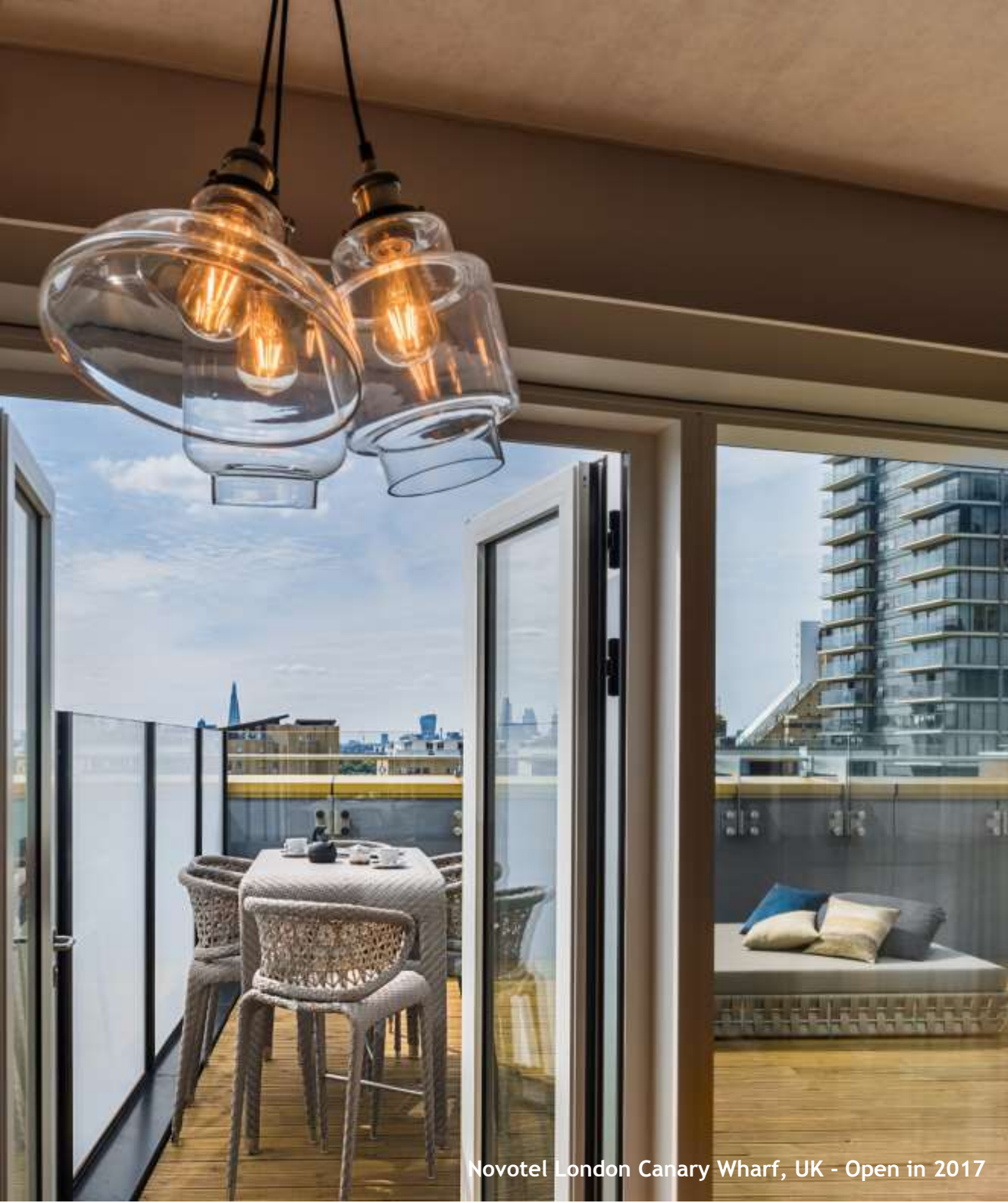
Novotel London Canary Wharf, UK - Open in 2017