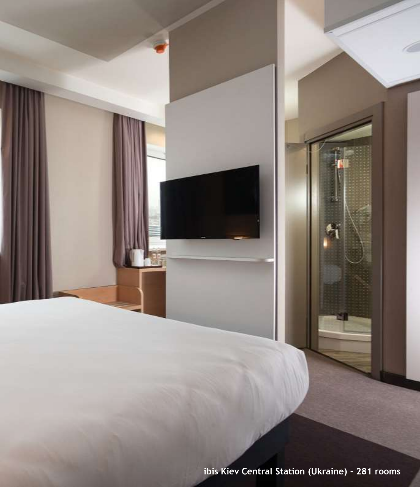
ibis Kiev Central Station (Ukraine) - 281 rooms