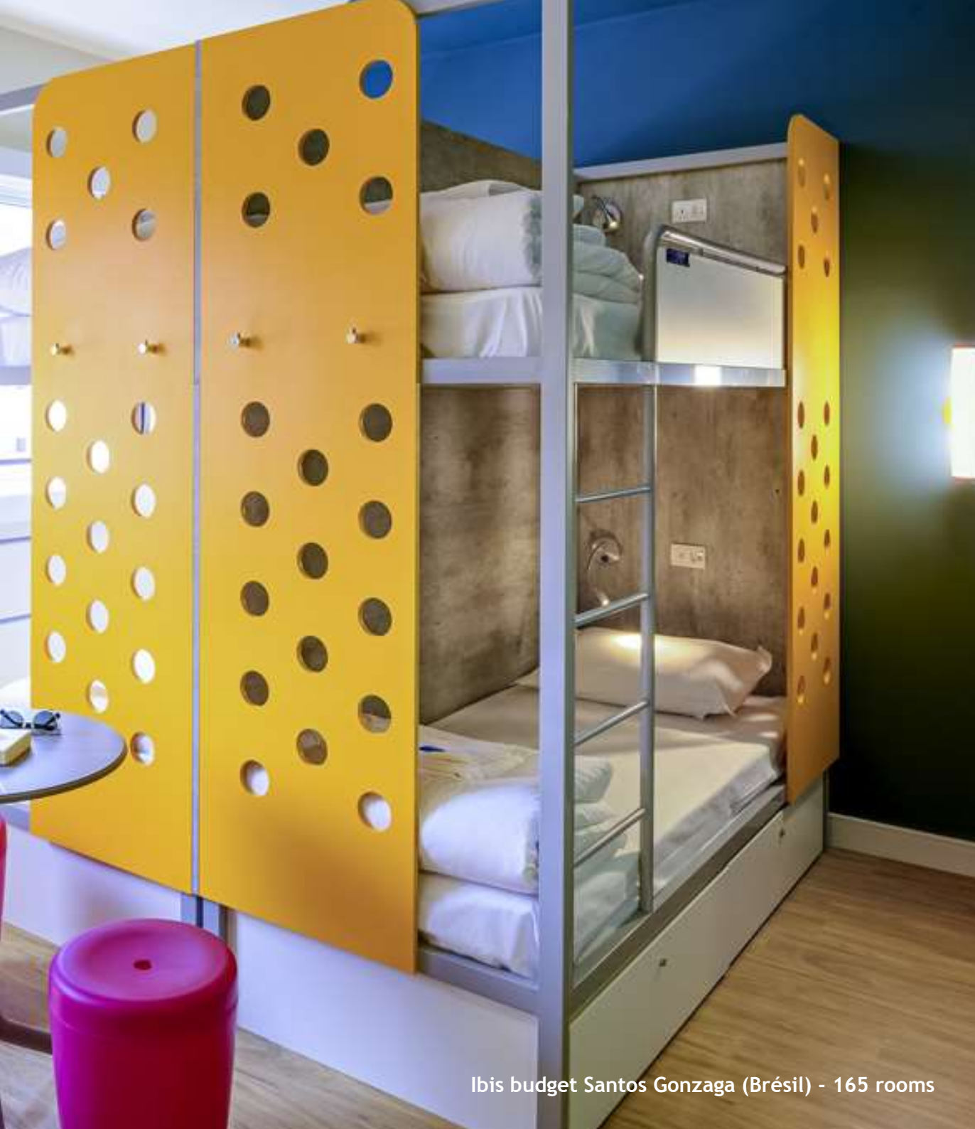
Ibis budget Santos Gonzaga (Brésil) - 165 rooms