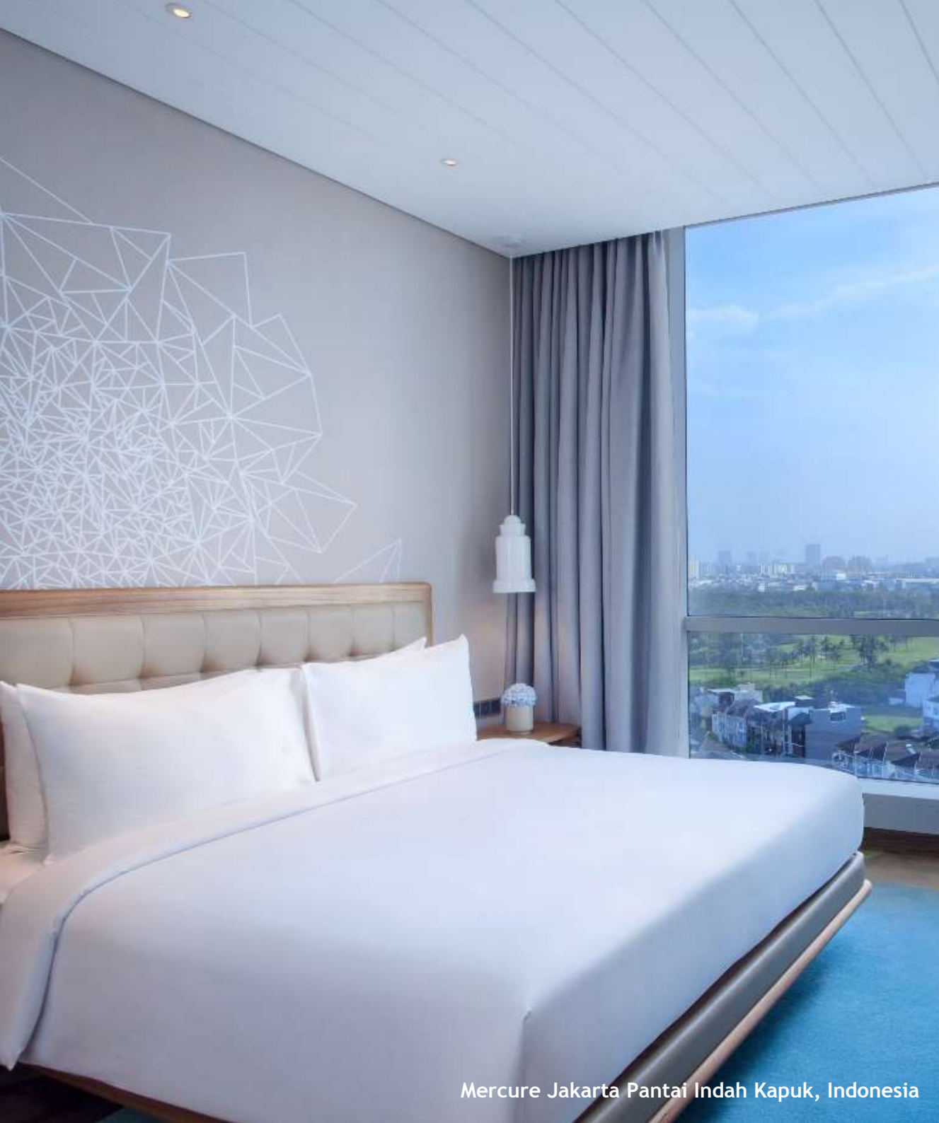
Mercure Jakarta Pantai Indah Kapuk, Indonesia